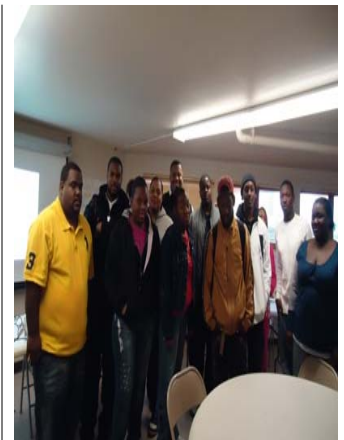
“TIES that Bind” Mentoring Participants

September, 2009 Fowler’s Mill Golf Course