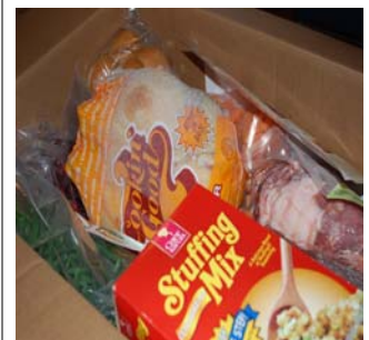
A box from Angel Food Ministries provided by The L.O.T. Initiative.