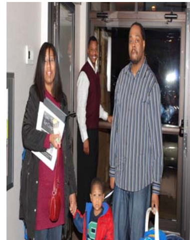
Healthy Marriage Training Participants